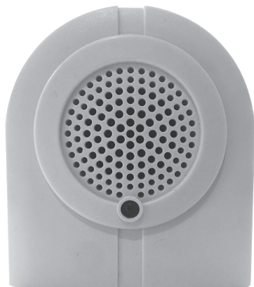
Product Code STV820